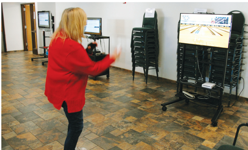
Wii Bowling at the LSV Senior Center.