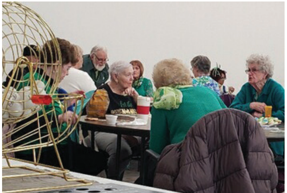
St. Patrick's Day bingo celebration at the LSV Senior Center.

Powerful Tools for Caregivers is owned and managed by Iowa State University of Science and Technology. Funding in whole or in part by AgeOptions.