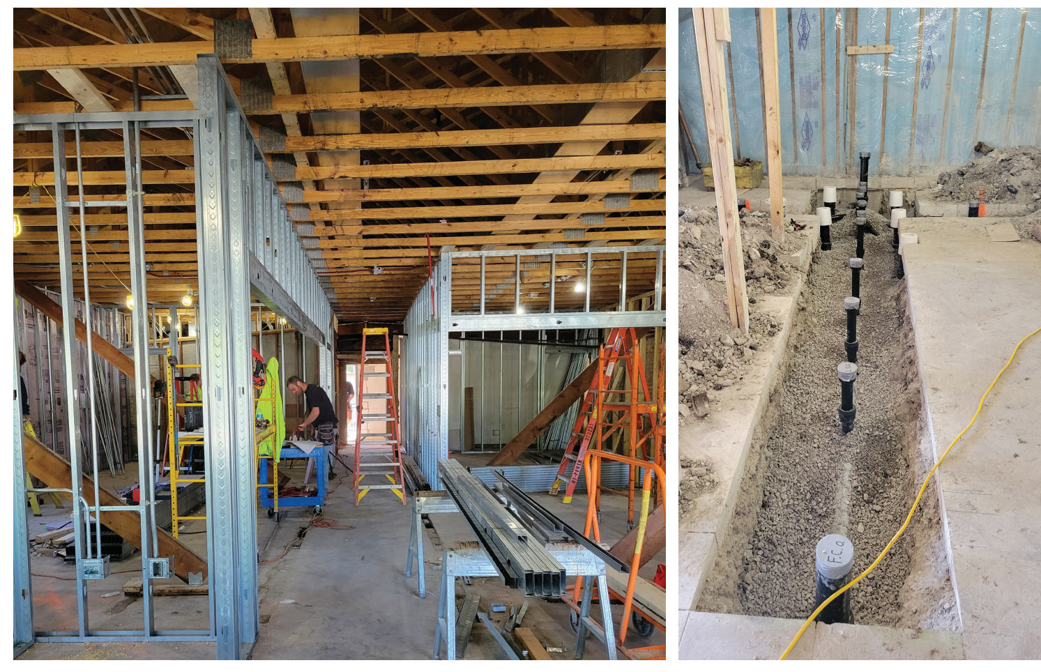
Construction continues at the Central Community Center with completion expected sometime this Fall.