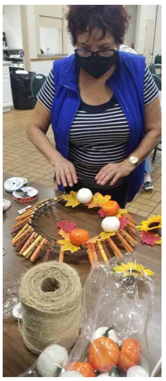
Township seniors at the North Community Center learn to make fall wreaths during a craft session with the Stickney-Forest View Public Library in October.